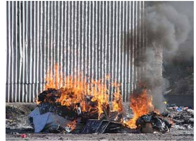
South Africa, Johannesburg: Future in flames (waste disposal)

Worldwide, a global regime of walling is fast contributing to the manufacturing of entire categories of unwanted people of which the illegal migrant, the undocumented worker, and more and more the refugee and the asylum seeker, are the prototypes. This global regime is characterized by the differential treatment of individuals, groups or communities with respect to movement or circulation. This differential treatment raises, at a deeper level, questions about the way in which the ‘ quality of being human ’ as such is instituted in a globalized society; the way in which the quality of being human becomes once